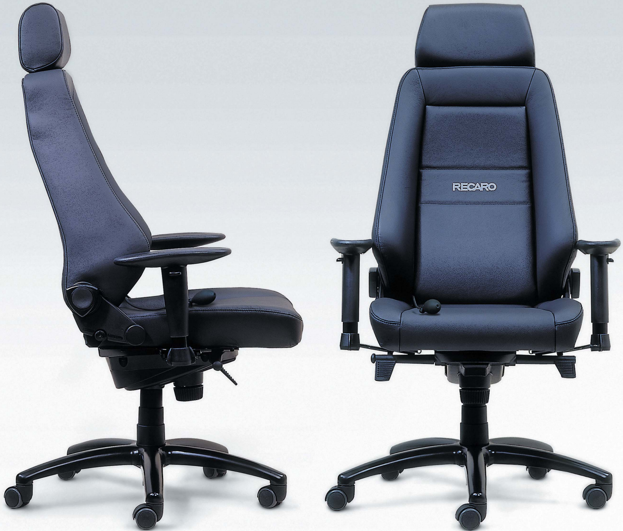
PHOTO : LEATHER BLACK

Design based on orthopedics and ergonomics For people engaged in work requiring long hours of sitting, their lower backs are released from fatigue.