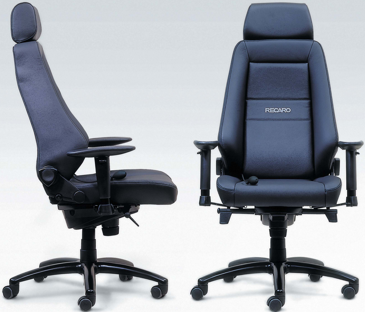
PHOTO : LEATHER BLACK

Design based on orthopedics and ergonomics For people engaged in work requiring long hours of sitting, their lower backs are released from fatigue.